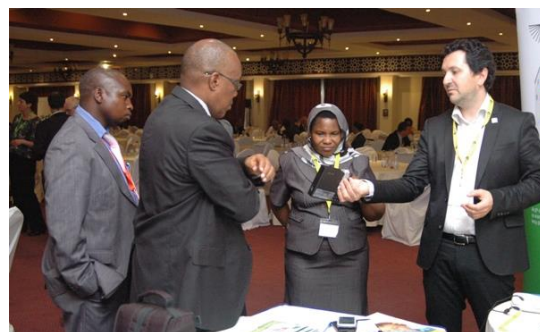
Sponsor display table